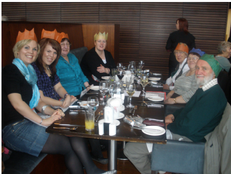
Volunteers enjoying themselves at last year's extravaganza!

This year's Volunteers Christmas Lunch is fast approaching! The lunch is one of our ways of saying 'thanks' for your commitment to volunteering with the Centre over the past year. The details of this year's lunch are as follows: